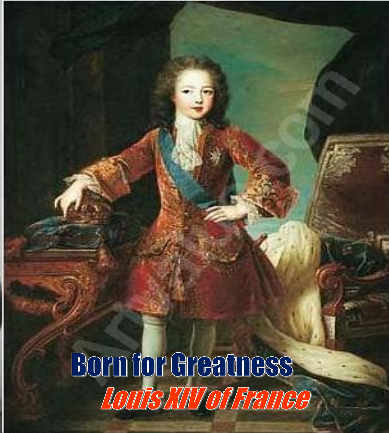
Born for Greatness Louis XIV of France